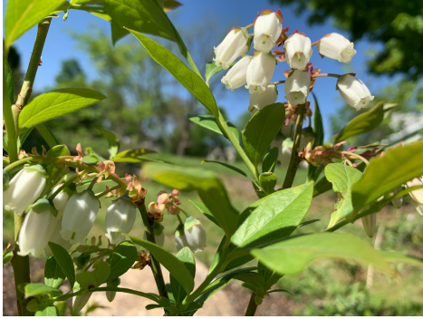
Orchard Blueberry blossoms!